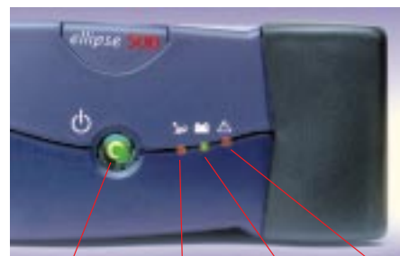
On/Off switch Overload Battery Status Fault